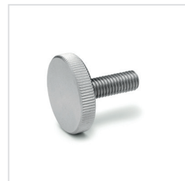
ROSTFREI® Inox Stainless Steel